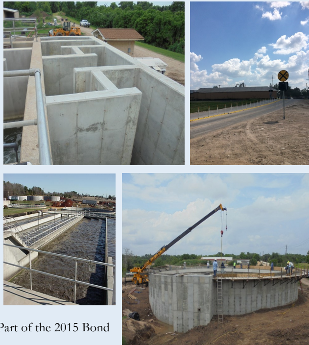
Part of the 2015 Bond